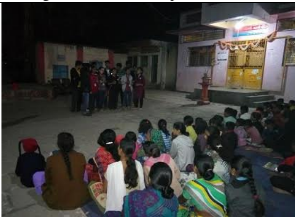
Street Play performed by volunteers