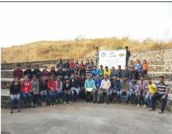
Volunteers visited to the Rani Laxmibai Military School