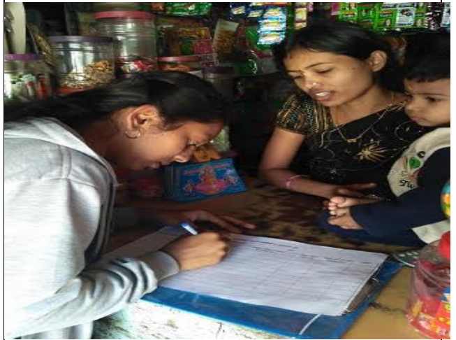
Survey Conducted by volunteers