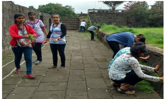
Volunteers participated in the cleanness drive conducted by NSS, SPPU at Shaniwarwada, Pune