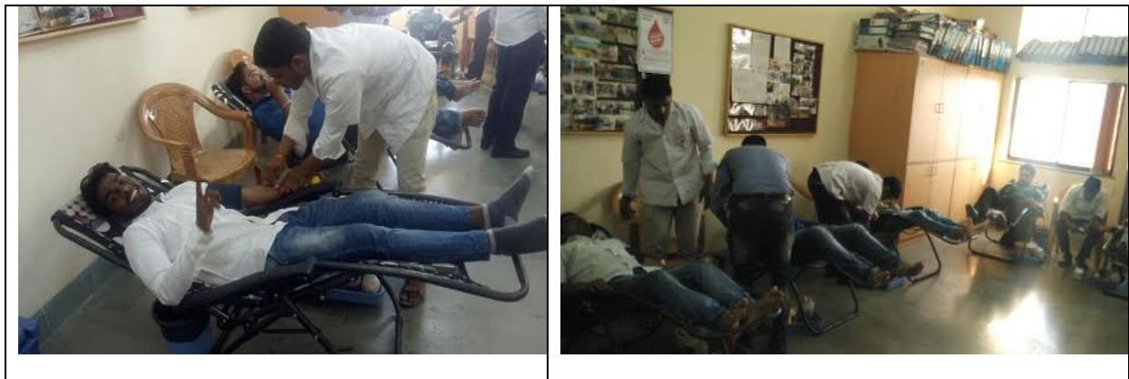
Volunteers participated in Blood Donation Camp