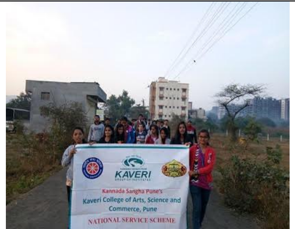
Awareness rally about Cleanliness