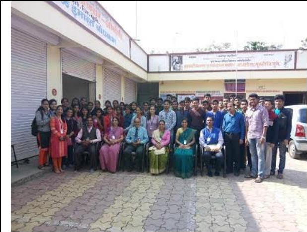
Inugration of NSS Camp at kasar amboli