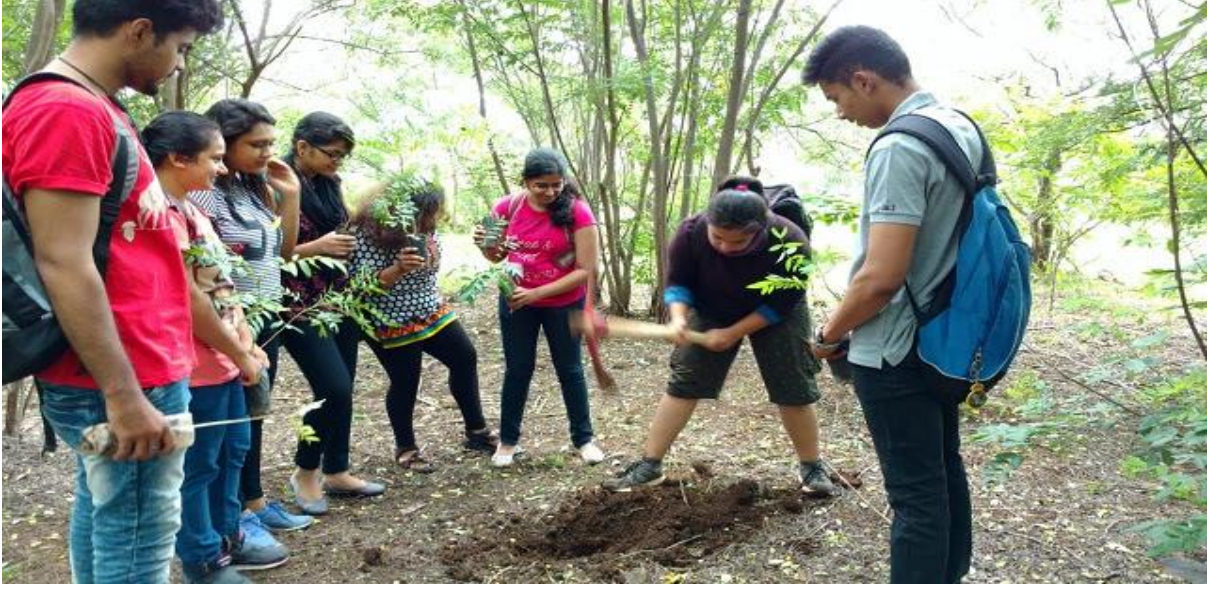
Volunteers digging pit for planting trees