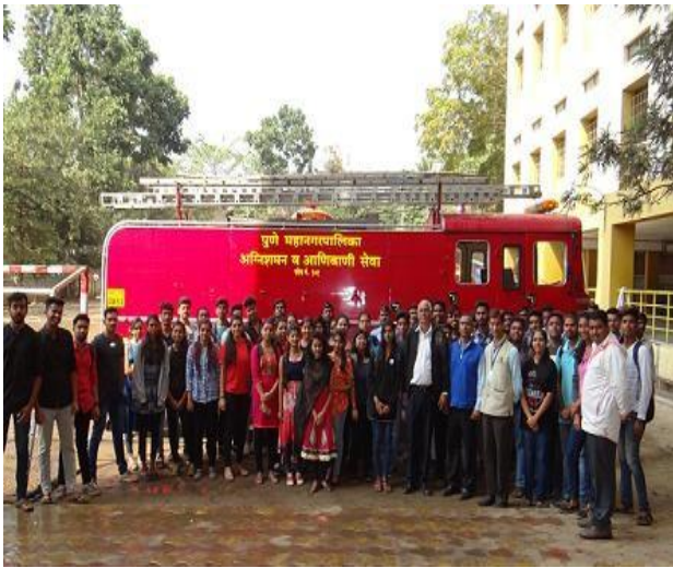
Demonstrations on Fire fighting