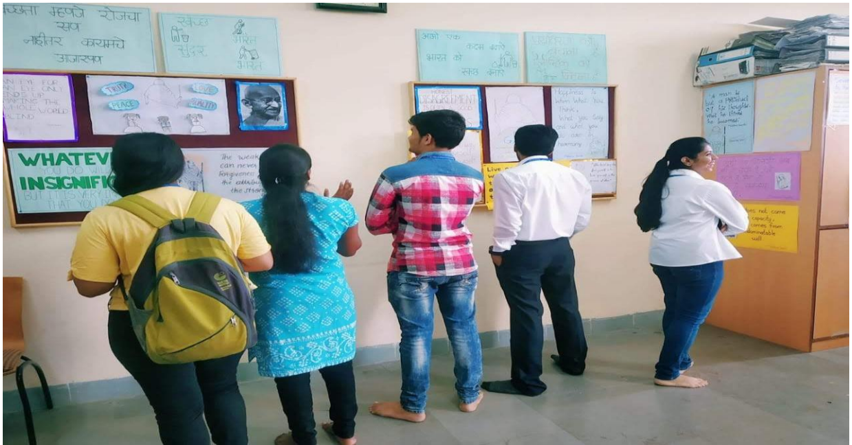
Exhibition on 'Mahatma Gandhi & his Thoughts