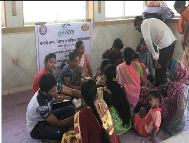
Health check-up drives