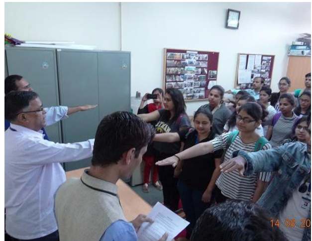
Cleanliness Drive and Cleanliness Oath Taking ceremony