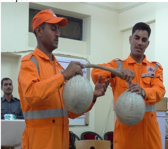
NDRF Session How to handle Pre and Post-disastrous situations