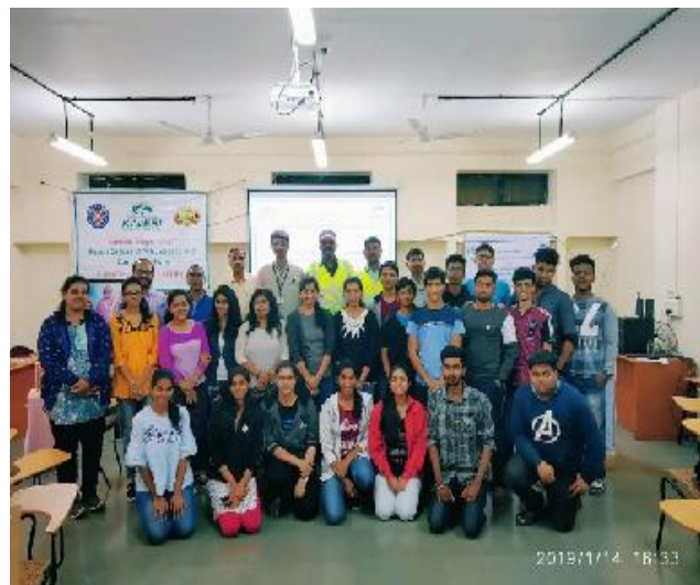
Volunteers actively participated in NDRF Session