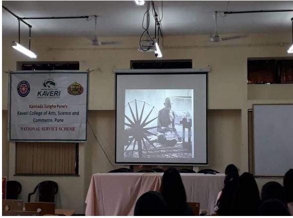
Documentary on Mahatma Gandhi