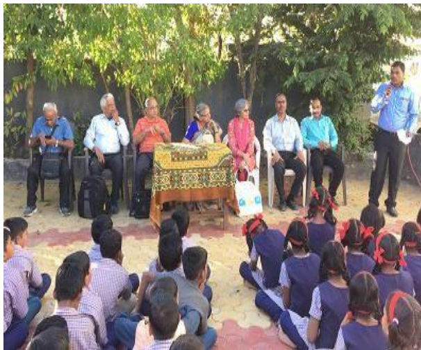
Vidyan Vahini – Demonstrated scientific experiments for the 5th to 8th standard students of Zilla parishad school, KasarAmboli