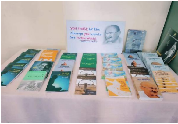
Books for Sale