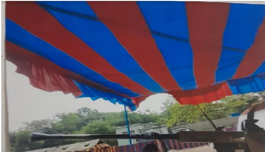
Army Exhibition at Golibar Maidan, Pune