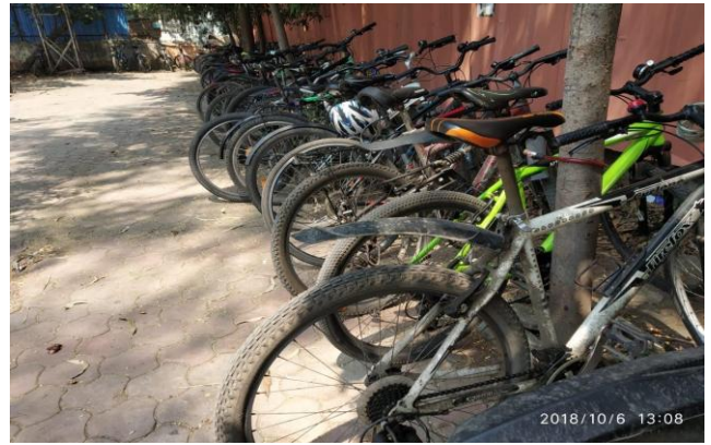
No Horn Day