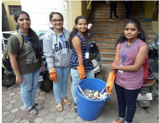
Cleanliness Drive under Swachhta Pakhwada at College Campus