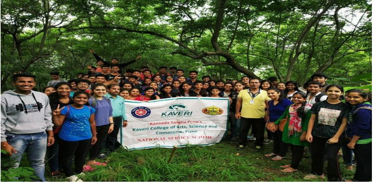
Volunteers participated in the Tree Plantation at ARAI Tekadi

KAVERI COLLEGE OF ARTS, SCIENCE & COMMERCE, PUNE-38. LIBRARY