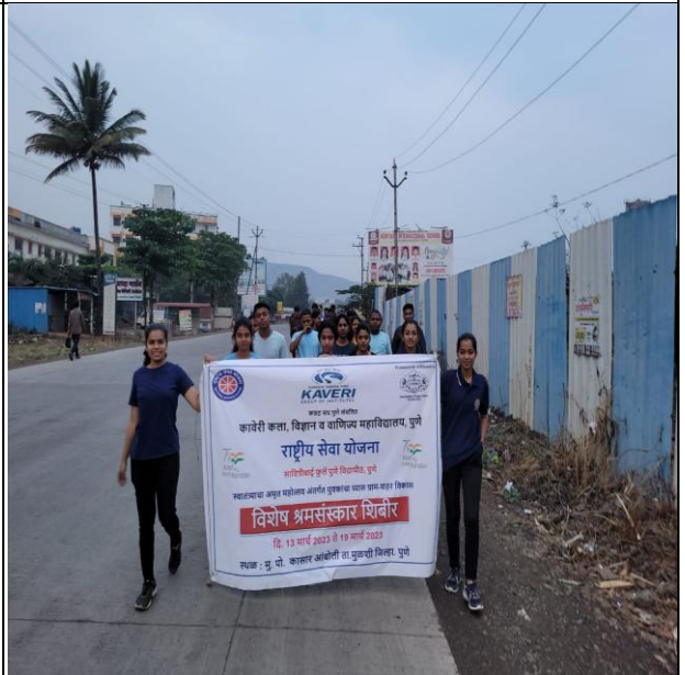
Awareness Rally on plastic free environment