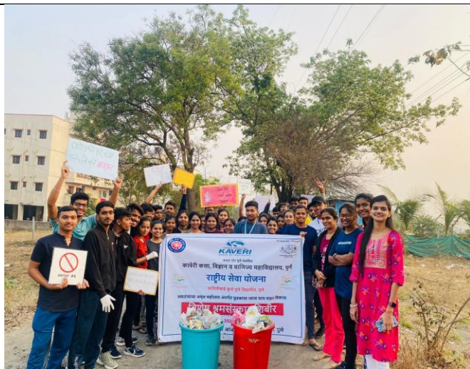
Cleanness drive at camp Site