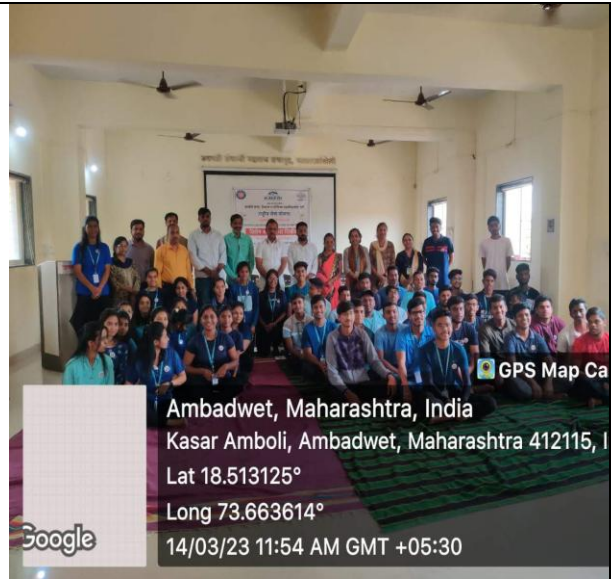
Inauguration of NSS Camp