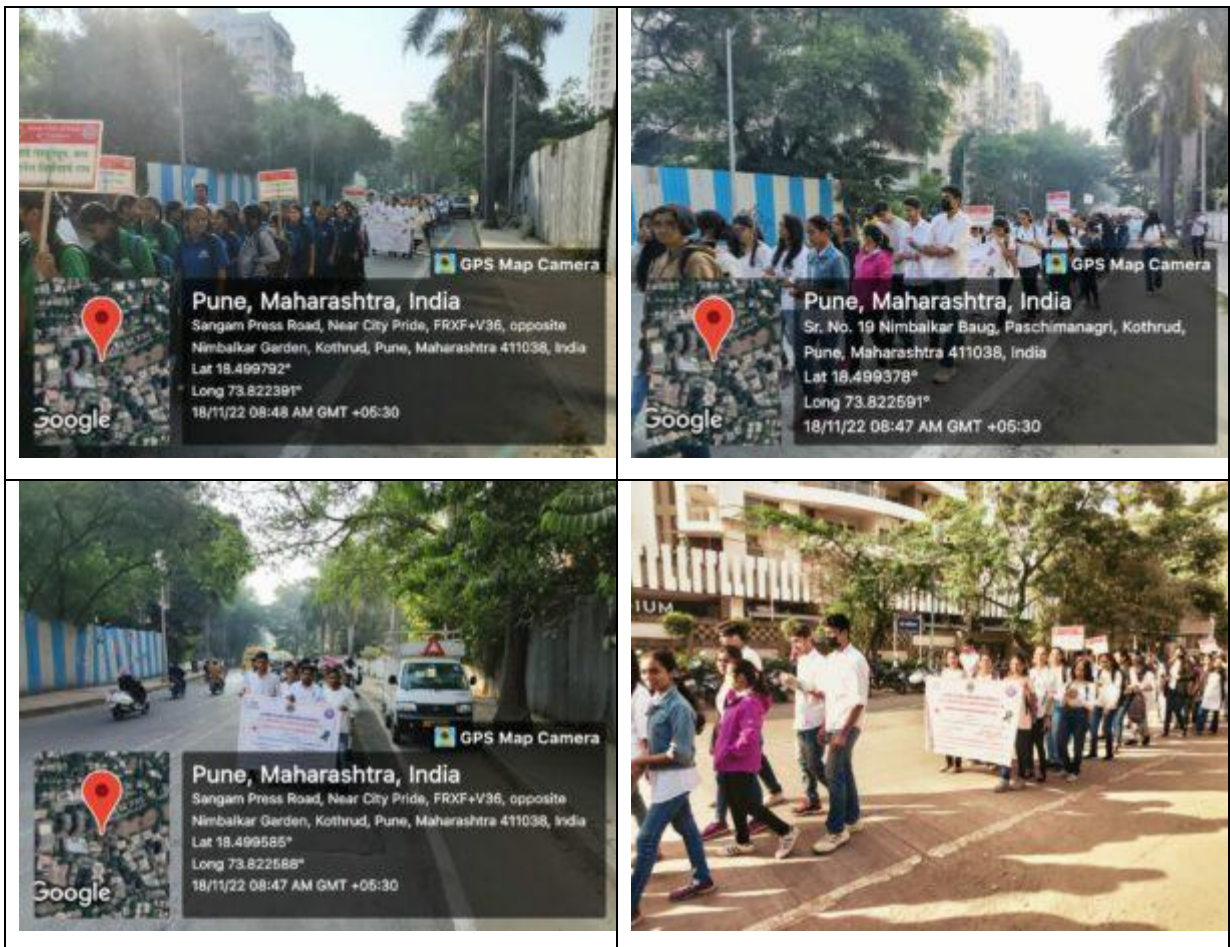
Diabetes Awareness Rally