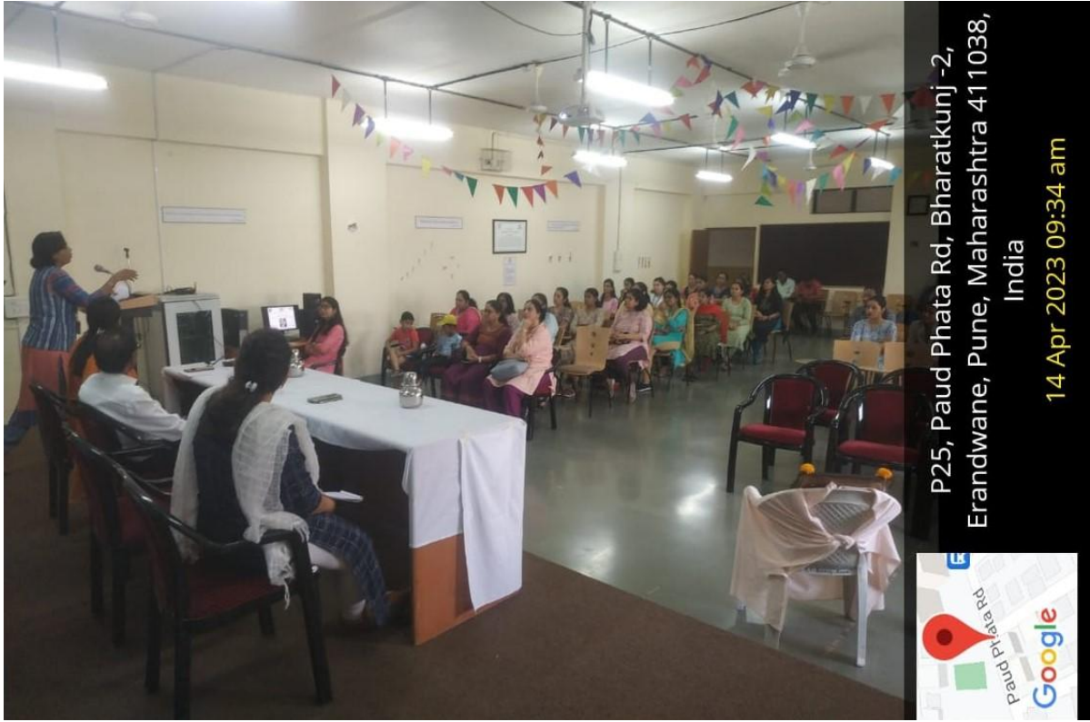
Celebration of 132nd Birth Anniversary of Dr Babasaheb Ambedkar