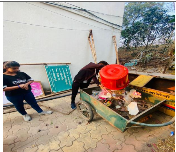
Disposing collected waste