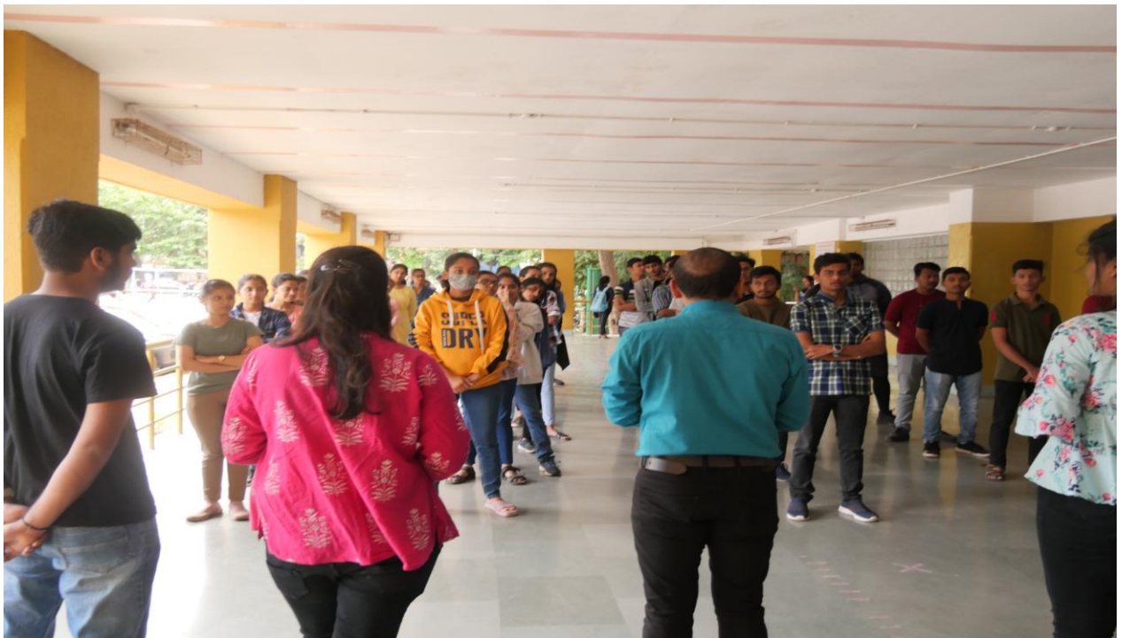
NSS PO explained importance of NSS Foundation day