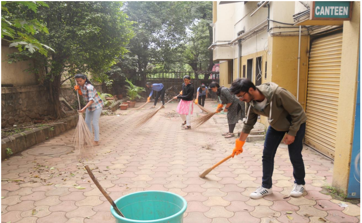
Cleanliness Drive on Occasion of NSS Foundation day