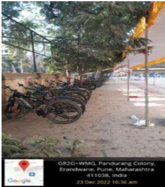
Conducted No Vehicle Day