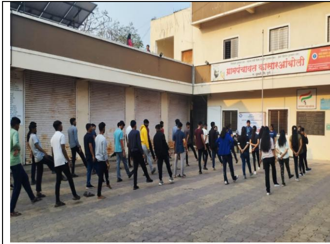
Morning exercise at camp