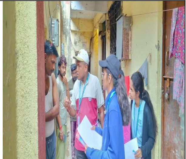
Post covid survey at camp site