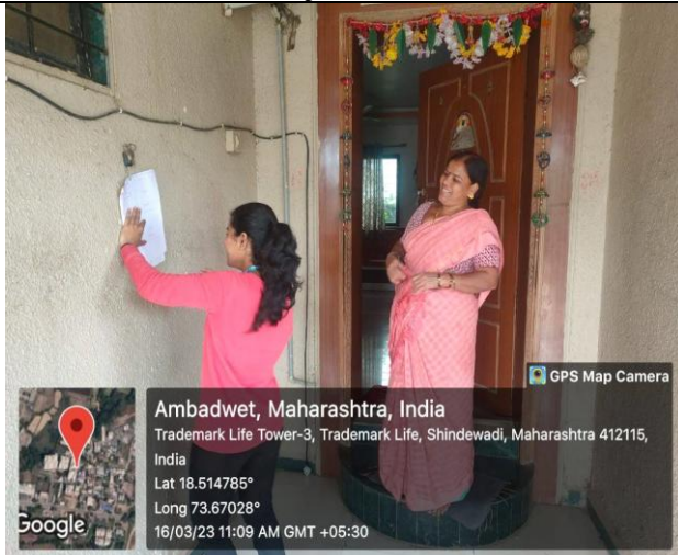
Post covid survey at camp site