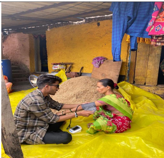
Volunteers check blood pressure at Camp village