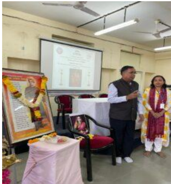
Celebration of birth anniversary of Swami Vivekananda