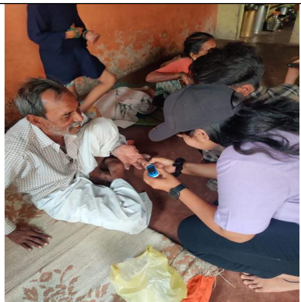
Volunteers conduct Sugar test at Camp village