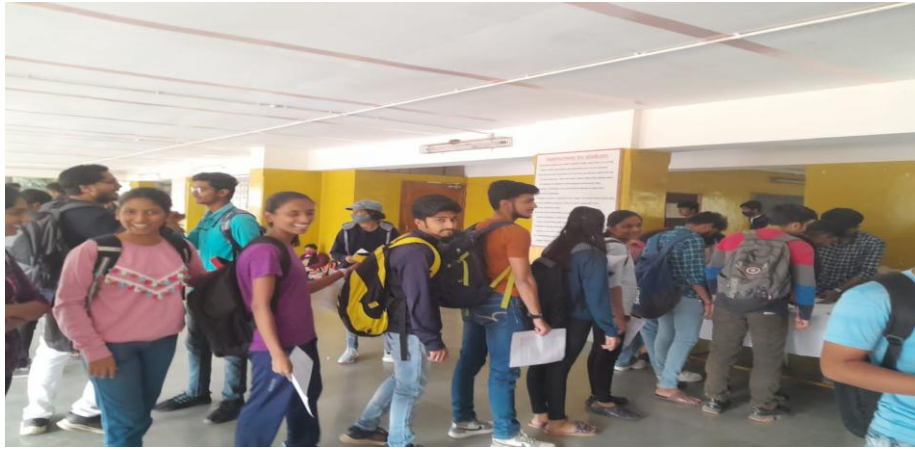
Students enrolling for new voter card