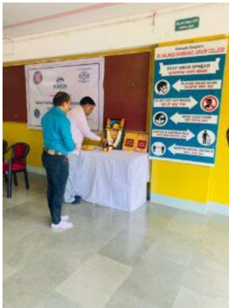
Celebration of Constitution Day