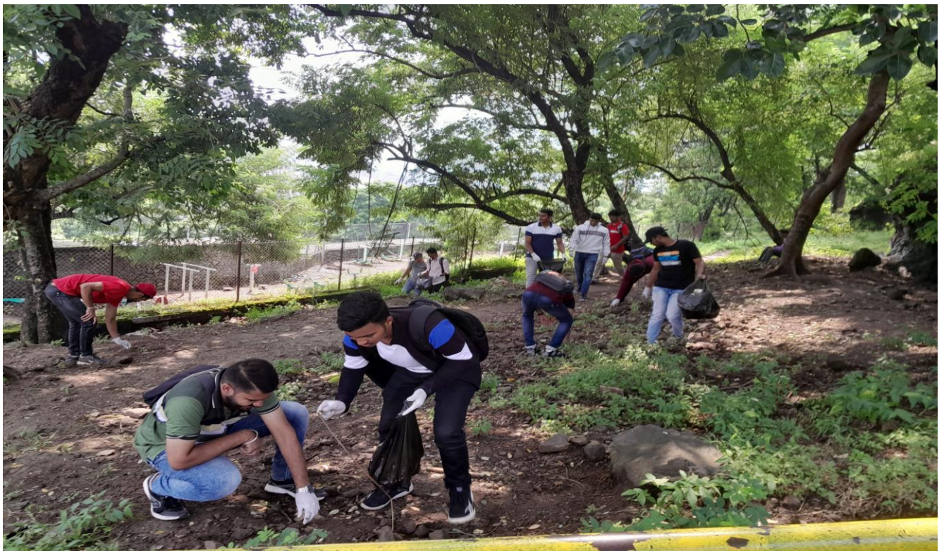
Cleanliness drive on 1st October 2022 at Parvarti hill