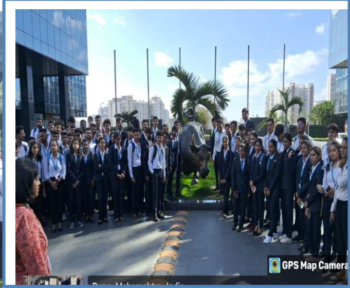
Visit to World Trade Centre