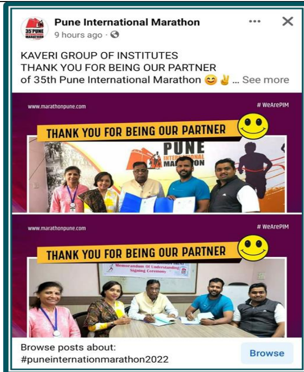
Signing of MOU with Pune International Marathon

They volunteered in the prize distribution ceremony as well, to conclude the event on a high note. The sporting spirit of Kaveri College's participants and volunteers is boosted further by the experiences from the three days' Marathon programme. Kaveri College is looking forward to have more achievement like this in future with the wonderful partnership of PIMT.