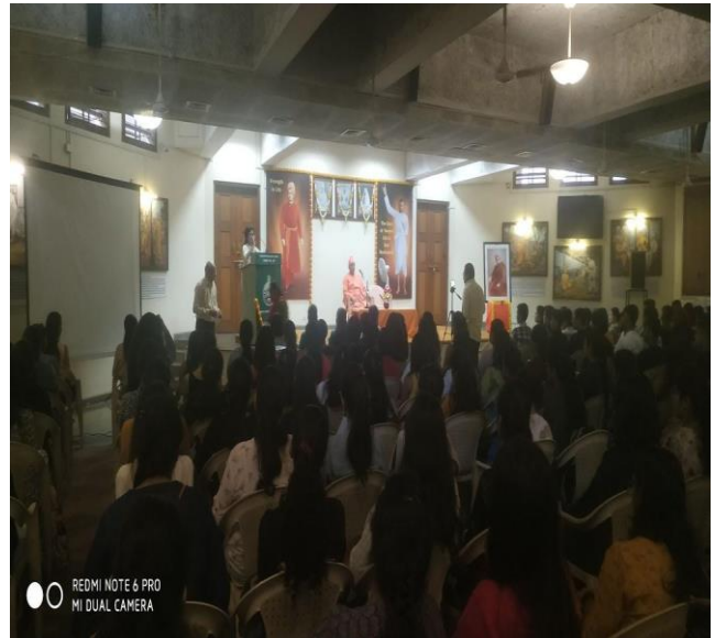
During BBA Orientation programme