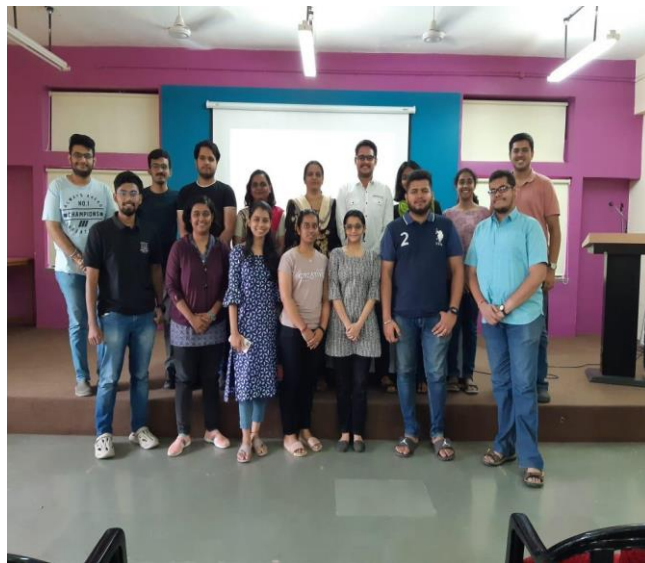
During M.com Orientation program