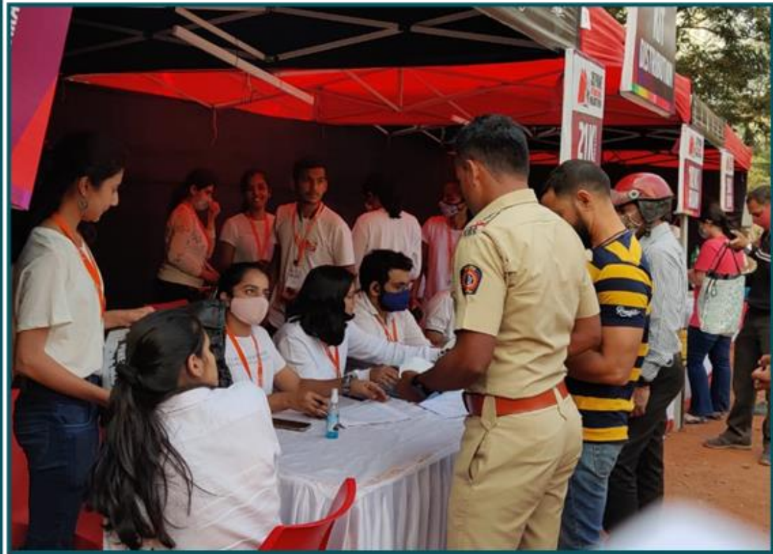
Students Volunteering during Pune International Marathon From 25 February 2022 to 27 February 2022