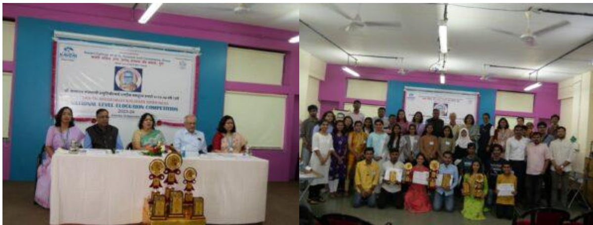
Judges and the winners of the competition

The programme ended with a photo session of the prize winners along with the dignitaries. The registration concluded with an overwhelming response of 41 participants from colleges across Pune, Ahmednagar, Satara, Aurangabad, Kolhapur, Raigad and Thane.