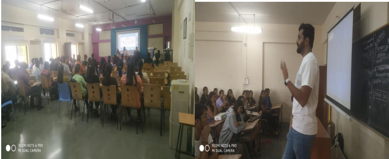
During BBA IB Orientation programme

a brainstorming session where students were told to sketch on the topic 'How I see myself in 2028'. The students prepared interesting drawings about their dreams, ambitions and passions.