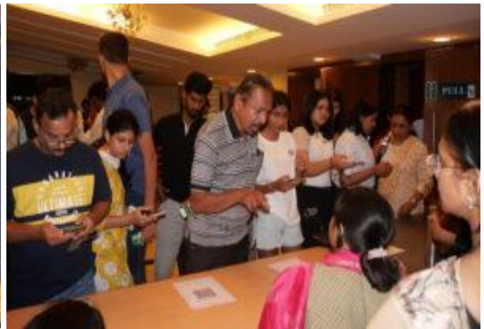
Workshop on Gateway to Professional Courses