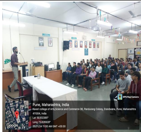
Session on cyber security.